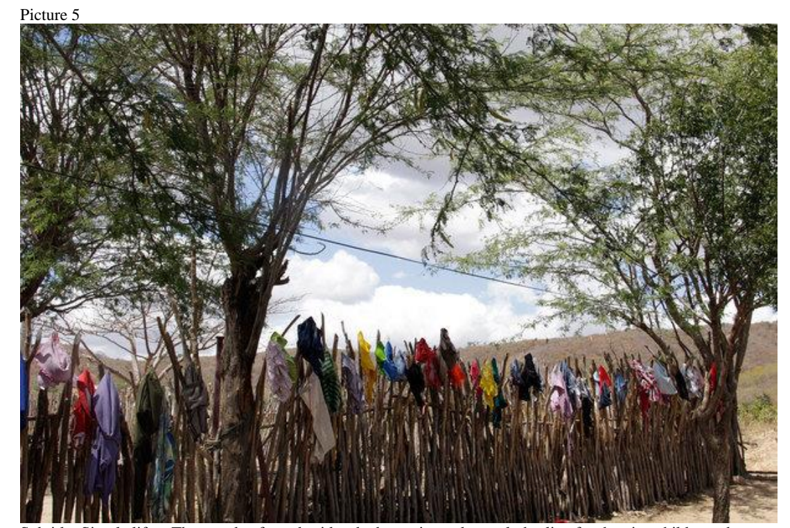
Subtitle: Simple life – The wooden fence besides the house is used as a clothesline for the nine children who wear them to go to school. The mother incentivates the children to study and seize opportunities.

Both images, as they focus the objects and their disposition in ordinary spaces of living and existence, lead us to think on how photojournalism may, in some circumstances, offer frameworks in spaces and landscapes but also their connection with the ordinary. These images bring elements of dignity that define the existence of women and their children through their objects of ordinary use and "each of those things is part of an existence that is completely actual, unavoidable, and unrepeatable" (Rancière, 2011, p. 293). So, "realizing, even if minimally, these existences and their place in the world are only possible if we establish passages between the objects and the non-representable expressed in its effectivity" (Rancière, 2011, p. 294).